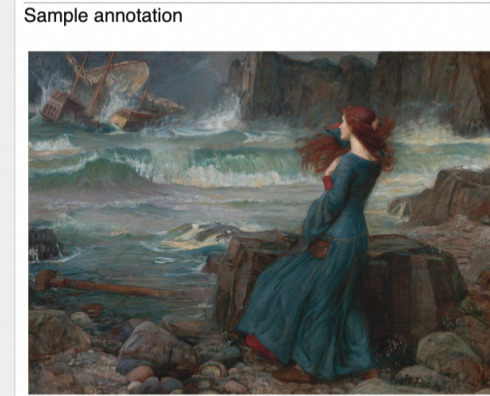
John William Waterhouse, The Tempest (1916)